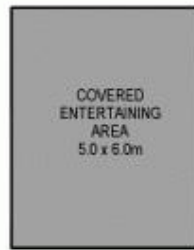
COVERED ENTERTAINING AREA 5.0 x 6.0m