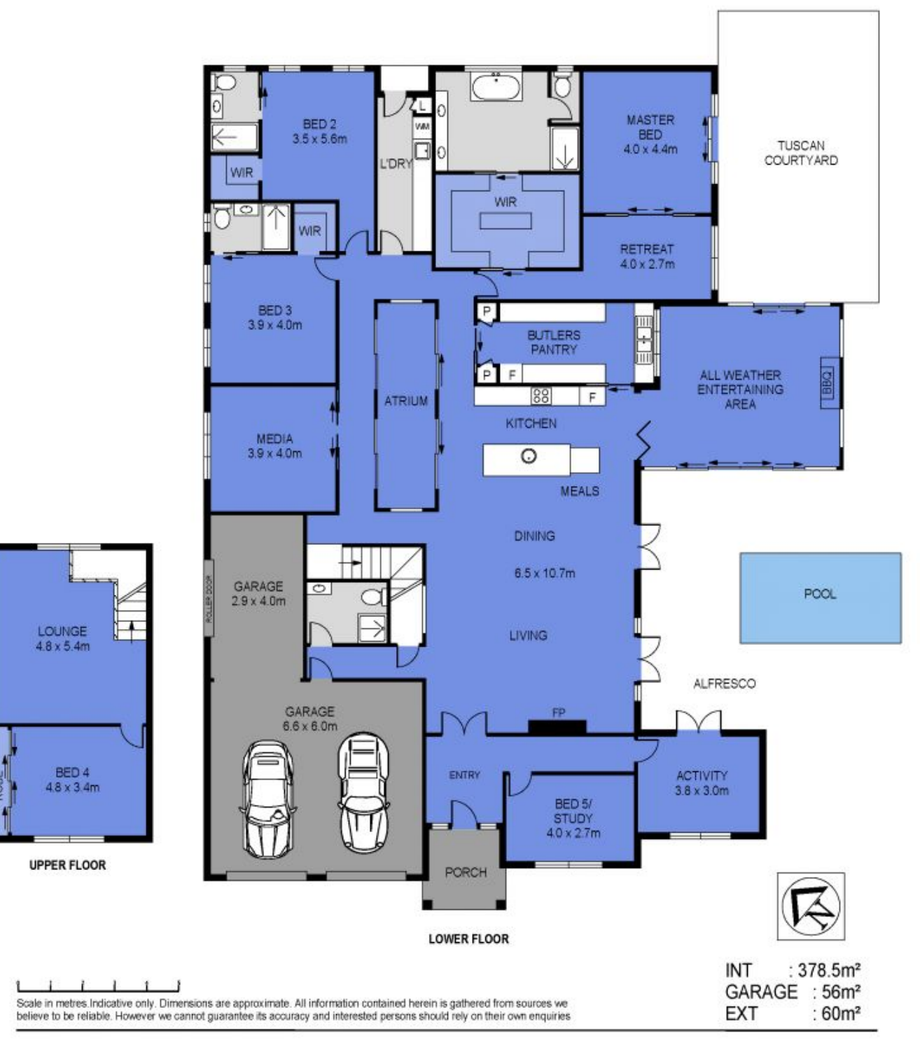
59-61 Norman Drive, Cornubia