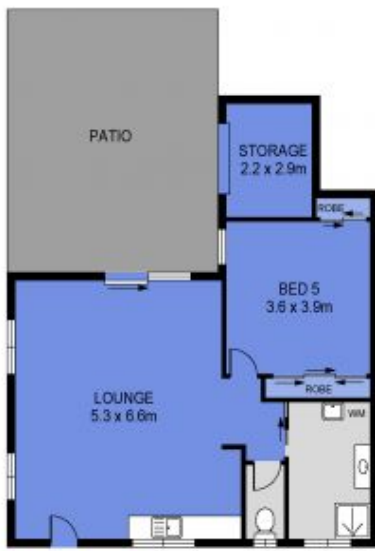
LOWER LEVEL DUAL LIVING